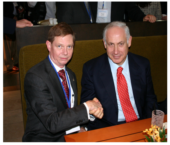
Israel's former Prime Minister, Binyamin Netanyahu, discusses variable rates and the reduction of critical peak demand Sunday, Nov 12, 2006 in Palo Alto, California with Tom Tamarkin.

Ron Nachman, Mayor, City of Ariel, Israel, selects Sacramento based USCL to partner with Israel Electric Company to replace 5,000 electric meters city wide with USCL technology to allow meter data communications between the meters, utility and consumers over the city's WiFi network.